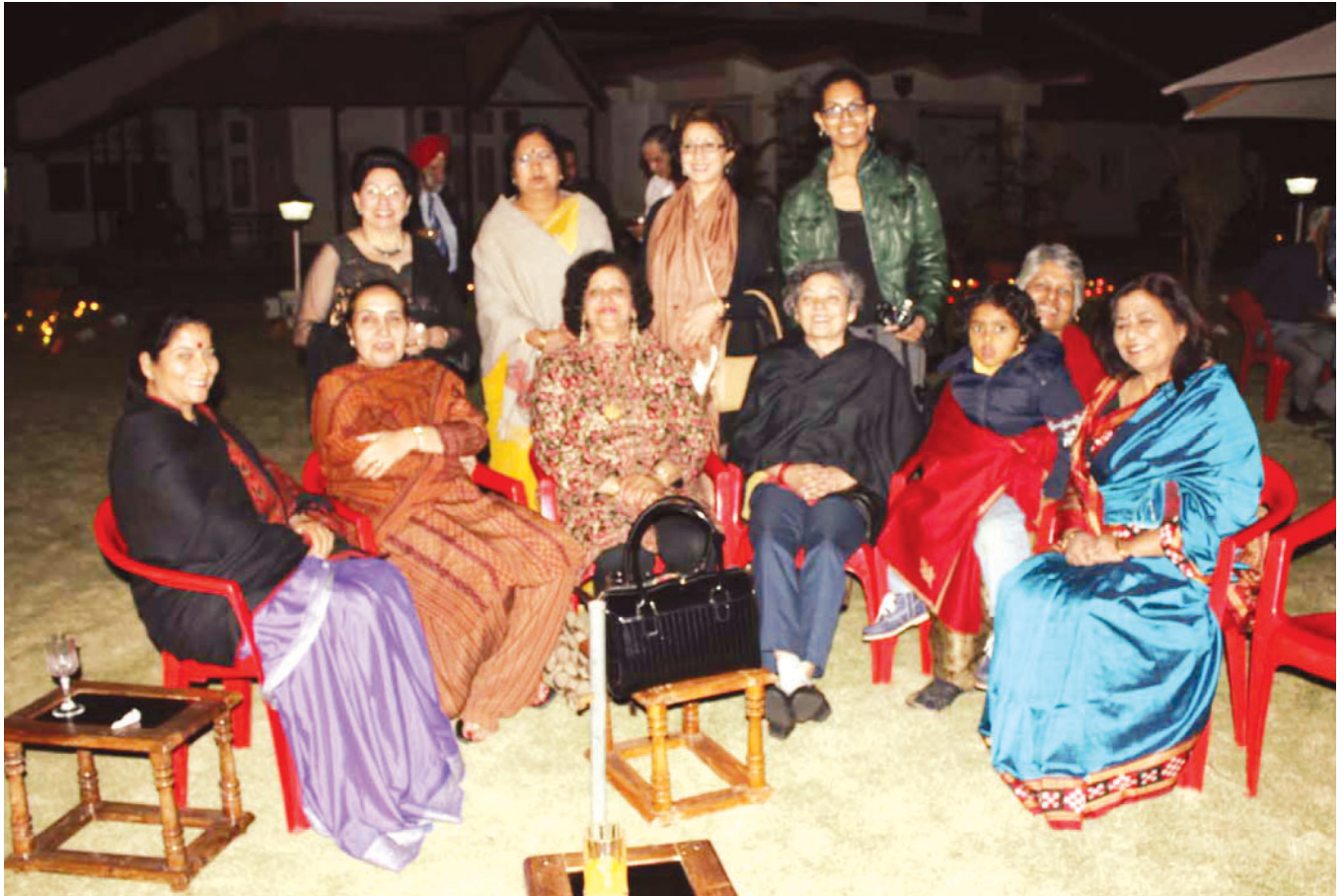
Some of the ladies married to the old boys of the class of 1963