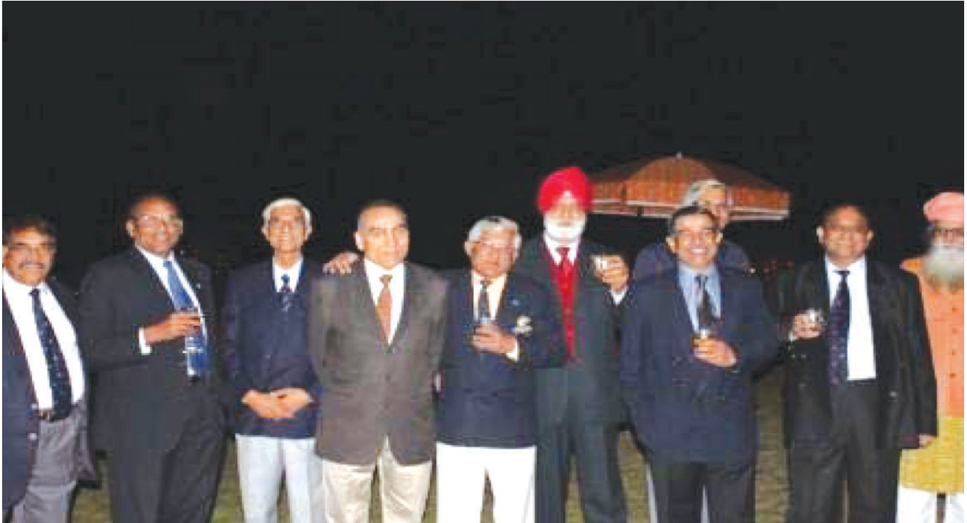
The batch of 1963 at their bash and the group photo (below)

The past is a pleasurable possession. When we look back, we always remember the good times we had and revel in the past. We also recall the hard times, but always with amusement and nostalgia. Our enmities with our rivals are forgotten; in fact they have become close friends. Above all, we have fond memories of the bygone days and the places and institutions where we grew up, shed our youth and learn't to take our place in the world order of grown ups. It is this nostalgia that compels us to return to the RIMC, year after year, with our families, and what better occasion than the Annual Founder's Day celebrations. I for one make my plans nine months in advance, and no other commitment is allowed to be planned within the extended family which could interfere with my trip to Dehradun. I must admit that this is only a recent phenomenon, having completed my worldly duties and now a free senior citizen.