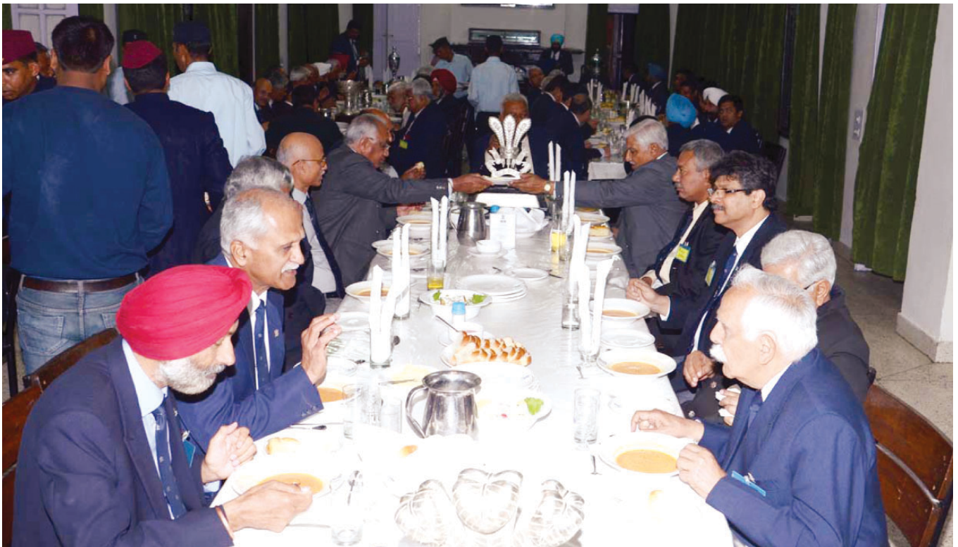
Old boys at dinner

With these thoughts pervading my mind, the 91st Reunion got underway, with the young and old alike, sharing equal exuberance at the mega event. Old sagas were retold and legends recreated as the Rimcollian Fraternity arrived at its Alma Mater. Over 150 Rimcollians from across the country and abroad come together to fondly recall their memories of old school ties at the two-day event.