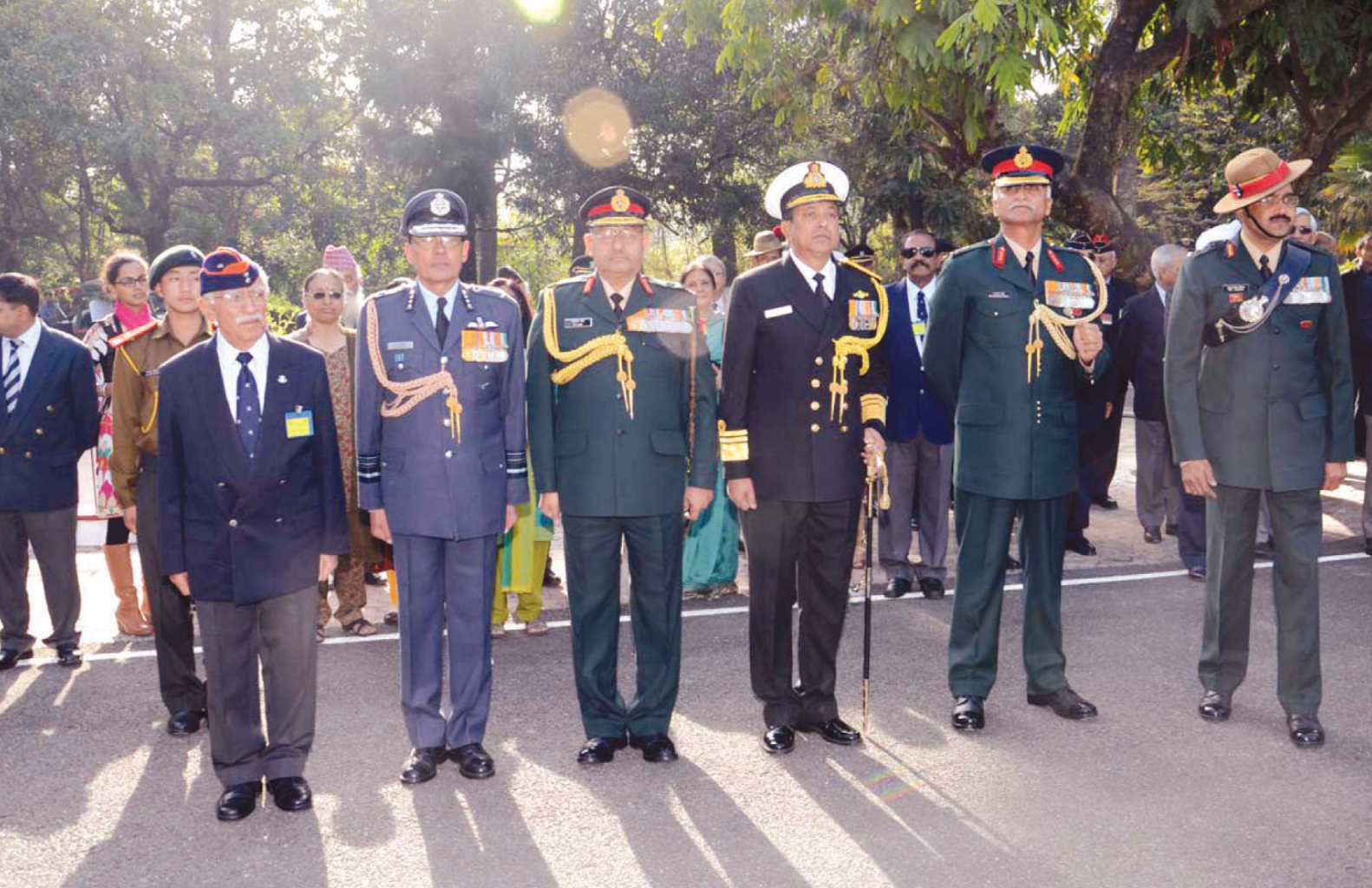
The Brass and high profile acquaintance