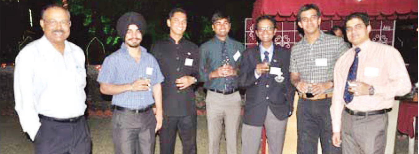
The Rimcollians at Pune

The Rimcollian Get-Together held in BEG Centre & Centre, Khadki on 09 March 2013 heralded the Annual Get Together conducted all over the country to celebrate the 91st Founders Day of our Alma Mater. The Get-Together as usual was a grand success with over 60 Rimcollians and 98 persons attending the function, hopefully making it the second largest gathering after the main celebrations in Dehra Dun.