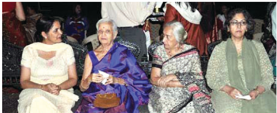
Ladies at Pune

Among the veterans and distinguished Rimcollians who graced the evening were