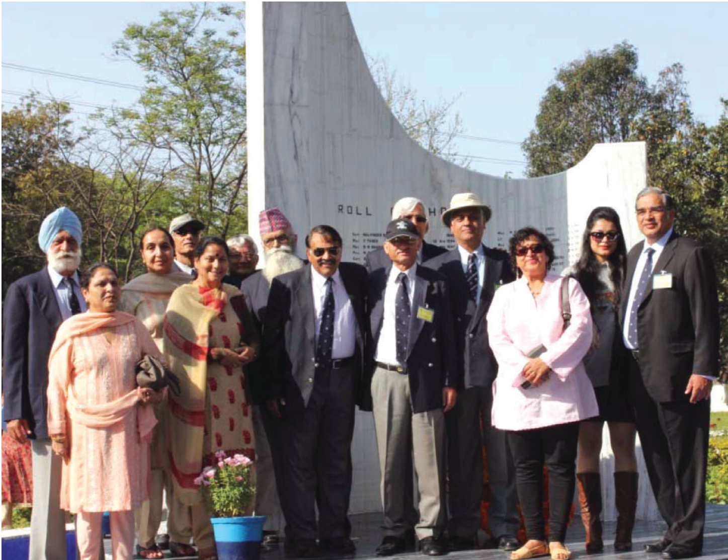
The batch of 1963 with ladies in front of War Memorial