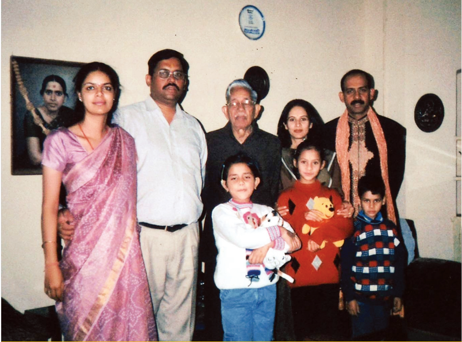
The Happy family (Standing in front of Mrs Singhal's Photograph)