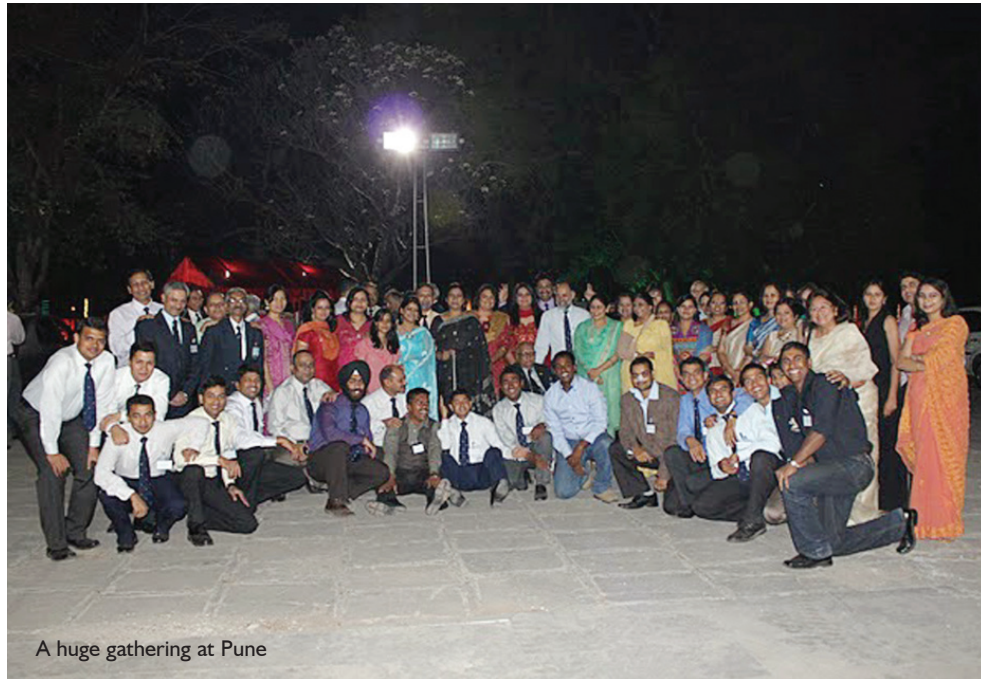
A huge gathering at Pune