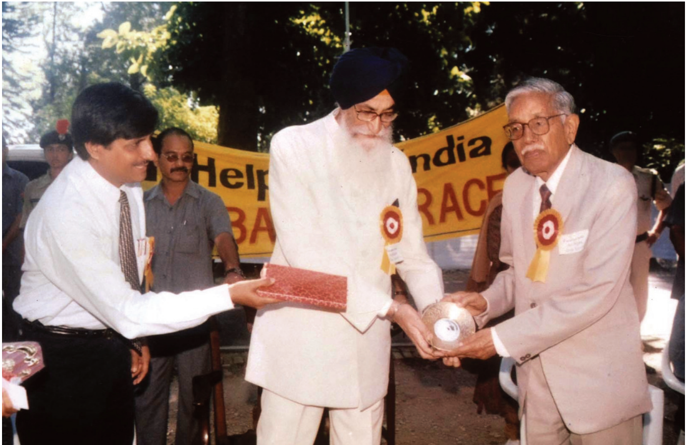
Receiving an award from the governor Mr Surjit Singh Barnala