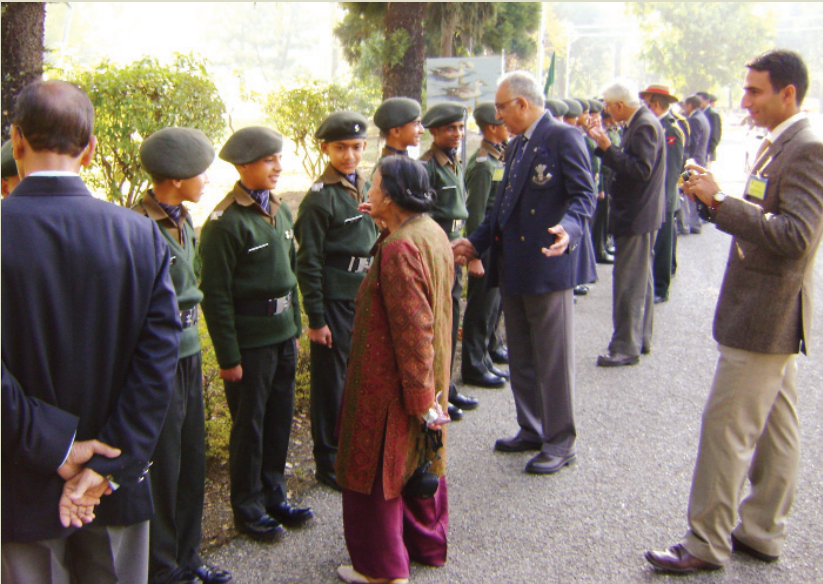
Old Boys and their families interacting with cadets