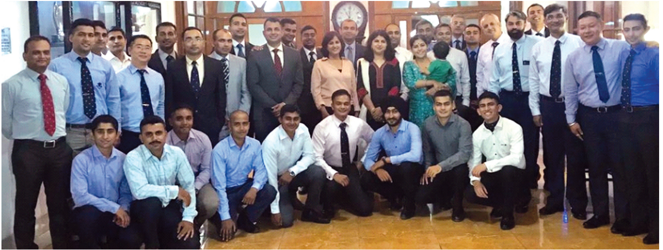
The Mhow Rimcollians

overall 3rd Best Young Officer in the Infantry Young Officer course serial no 145 in Mhow.