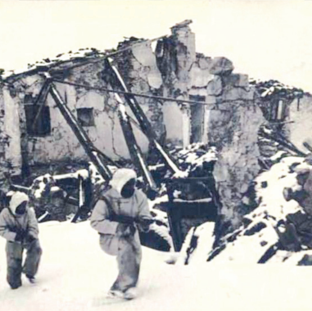
Indian troops carry out snow patrols during the Battle Of Monte Cassino

The Battle of Monte Cassino (also known as the Battle for Rome and the Battle for Cassino) was a costly series of four assaults by the Allies against the Winter Line in Italy held by Axis forces during the Italian Campaign of World