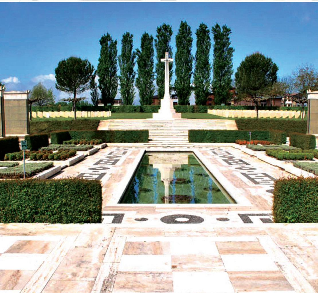
The Cassino War Cemetery Memorial which commemorates over 4,000 Commonwealth servicemen who took part in the Italian campaign whose graves are not known