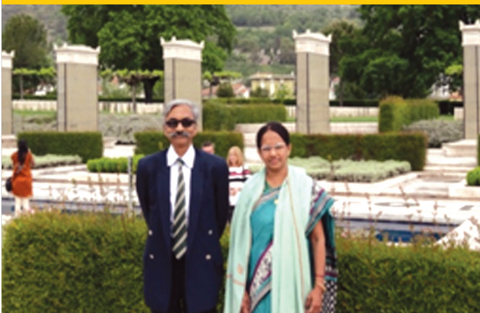
At Cassino War Cemetery

After a day's stay in Rome, we travelled by train to Cassino, On our request, the Defence Attache in the Embassy of India, Rome, a Captain from the Indian Navy, had kindly tied up our meeting with the Mayor of Cassino. At Cassino Railway Station, we contacted the Secretary to the Mayor. She was