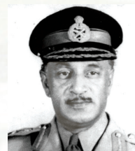
GENERAL KS THIMAYYA