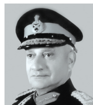
LT GENERAL KS KATOCH