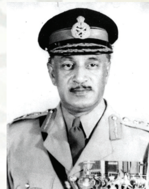
GENERAL KS THIMAYYA