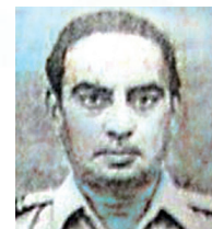
AIR COMMODORE NANU SHITOLEY

World War II redefined the world we live in. Indians fought with distinction in Europe and North Africa against Germany and Italy, as well as in SE Asia against the Japanese, albeit under the British Flag. Indian soldiers were instru-