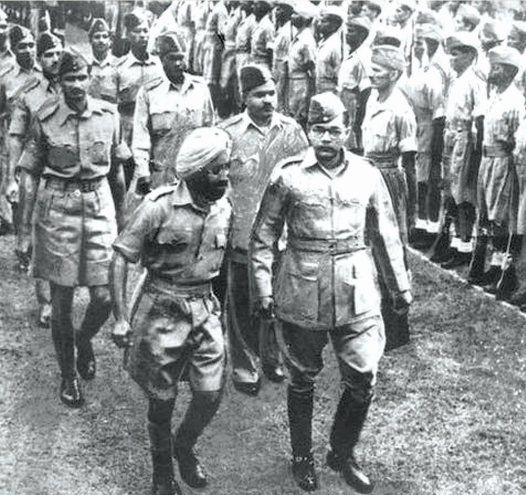
Subhash Chandra Bose being presented a Guard of Honour by the troops of the Indian National Army