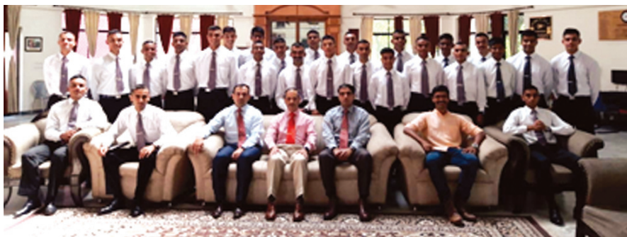
The IMA Rimcollians at RIMC

At RIMC, we have been regularly interacting with them, and formally invited them to visit the school a few times wherein we motivated them to do well in this crucial pre-commission training stage. I meet them before the important camps and events and in fact the last meeting was on 11 December 2018, a day prior to Choice of arms. They were also invited for the Commandant's dinner for the graduating course to serve as mutual inspiration. They also interact with the Masters and the boys, and this way a two-way process of interaction and feedback is sustained. Many of them also got their parents to the school during the December Passing out Parade, to pay respects and once again show to their parents where their journey begin. ■