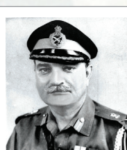
2/LT (LATER LT GEN) PREMINDRA SINGH BHAGAT