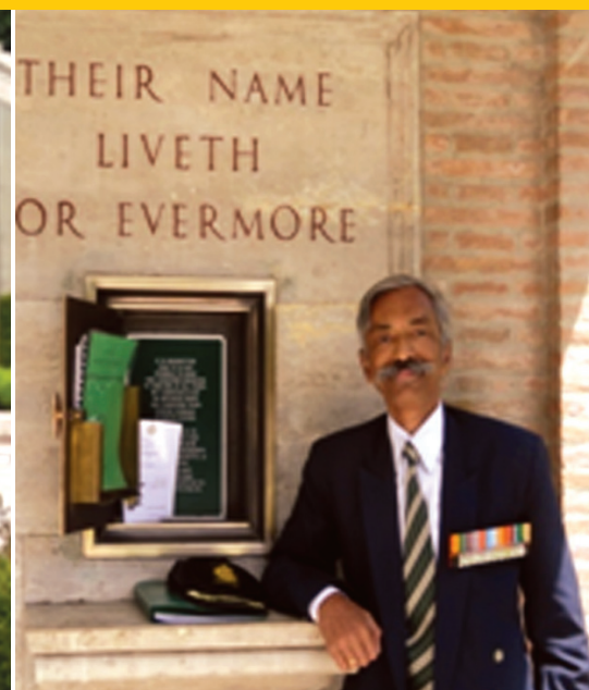
After Signing the Visitors Book