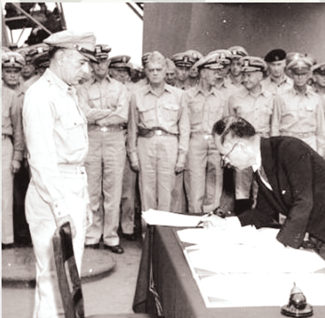
Japanese foreign affairs minister Mamoru Shigemitsu signs the Japanese Instrument of Surrender On September 2, 1945