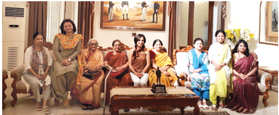
The Rimcollian Ladies at the AOC Mess on 25 November 2018