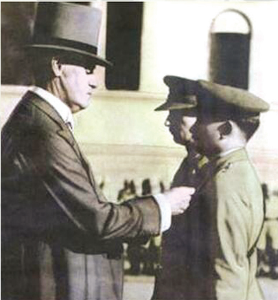
Second Lieutenant Premindra Singh Bhagat being formally invested with the decoration by the Viceroy of India Lord Linlithgow at Viceroy's House in New Delhi on 10 November 1941

From 31 January To 3 February 1941 , a column of 3/12 Royal Frontier Force Rifles, including a detachment of 21 Field Company under 2/Lt PS Bhagat, was sent towards Metemma. Bhagat's Bren carrier passed through a heavily mined