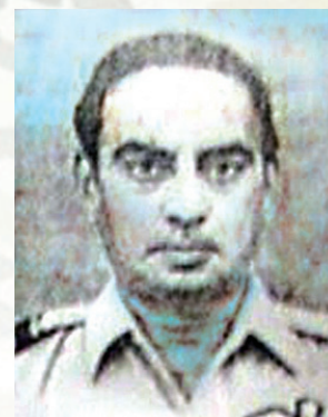
AIR COMMODORE NANU SHITOLEY