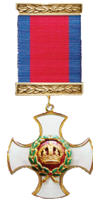
DISTINGUISHED SERVICE ORDER