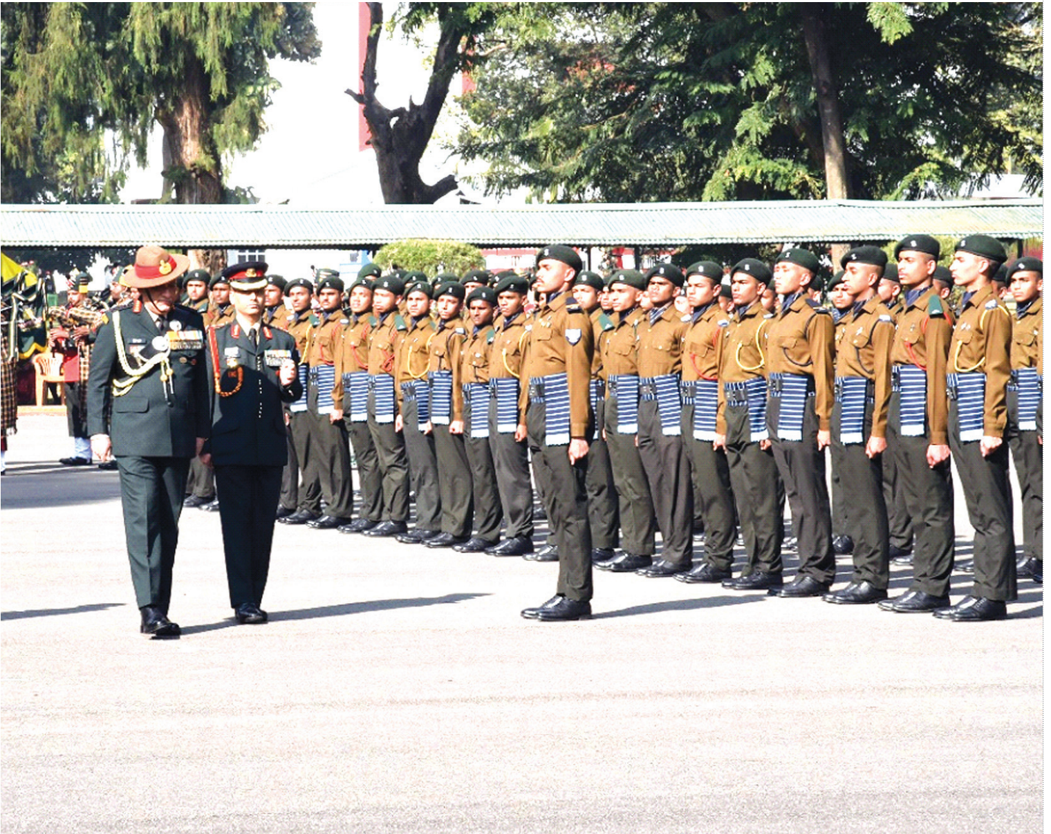
Reviewing the Guard of Honour

It was a historic day for RIMC to have the COAS grace the occasion as the Chief Guest for the graduation ceremony. Prior to him, the last COAS, who was not a Rimcollian, to visit RIMC was Gen KV Krishna Rao during the Diamond Jubilee celebration in 1982.