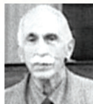
BRIGADIER NAND LAL KAPUR