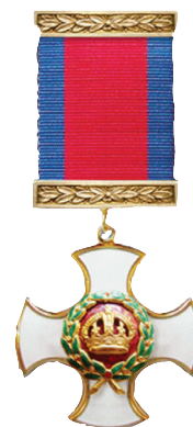
DISTINGUISHED SERVICE ORDER

Kodandera Subayya Thimayya was in 1944 posted to his old regiment as Commanding Officer of 8/19th Hyderabad, which he led with outstanding success during the Burma campaign. Thimayya was promoted to the acting