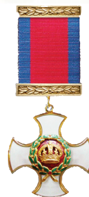
DISTINGUISHED SERVICE ORDER