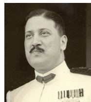
MAJOR GENERAL NKD NANAVATI