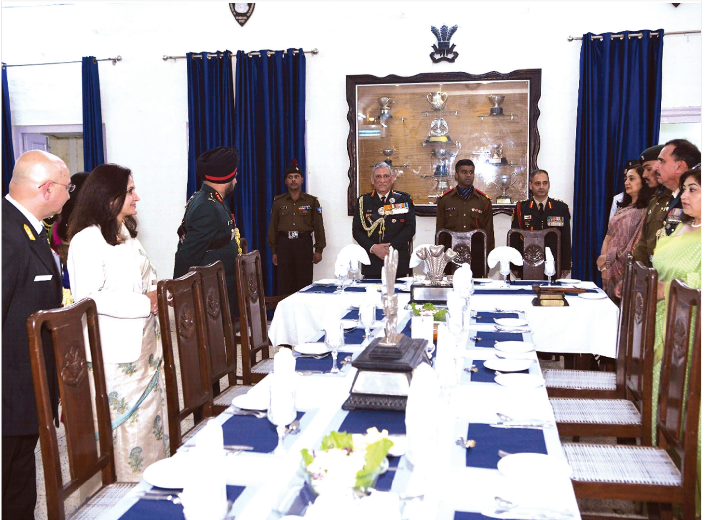
COAS in the Cadets Mess

The visit almost did not take place. Due to certain exigency, the COAS was nominated as the reviewing officer for NDA Passing Out Parade on 30 November 2018. However, he kept his commitment to be with RIMC on 29