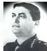
MAJOR GENERAL MG RAJWADE