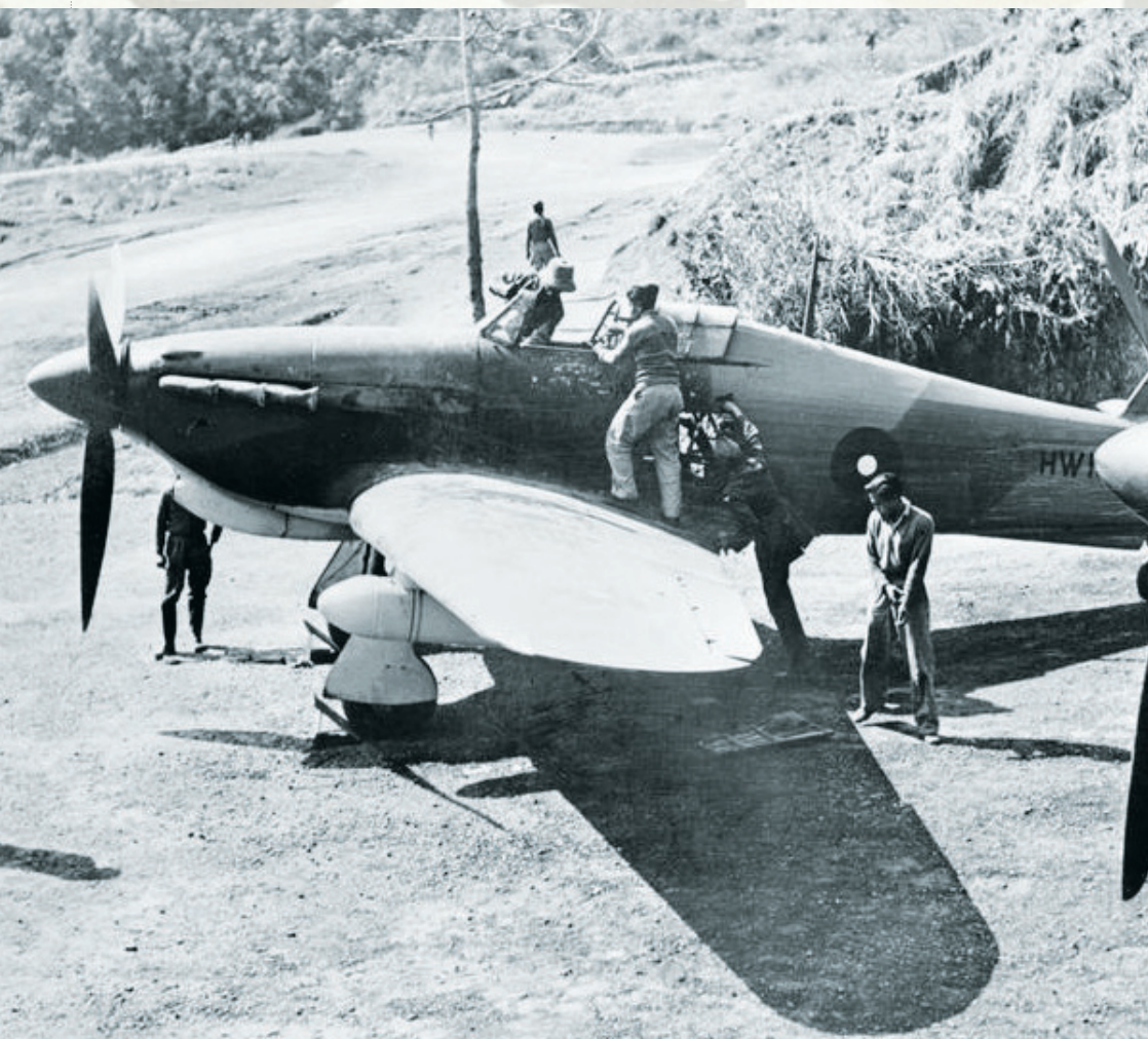
An Hawker Hurricane Mark IIBs of No. 1 Squadron IAF undergoing maintenance at Imphal Main