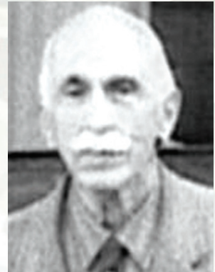
BRIGADIER NAND LAL KAPUR