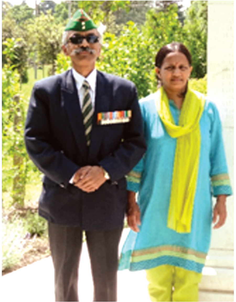
At Forli Cemetery