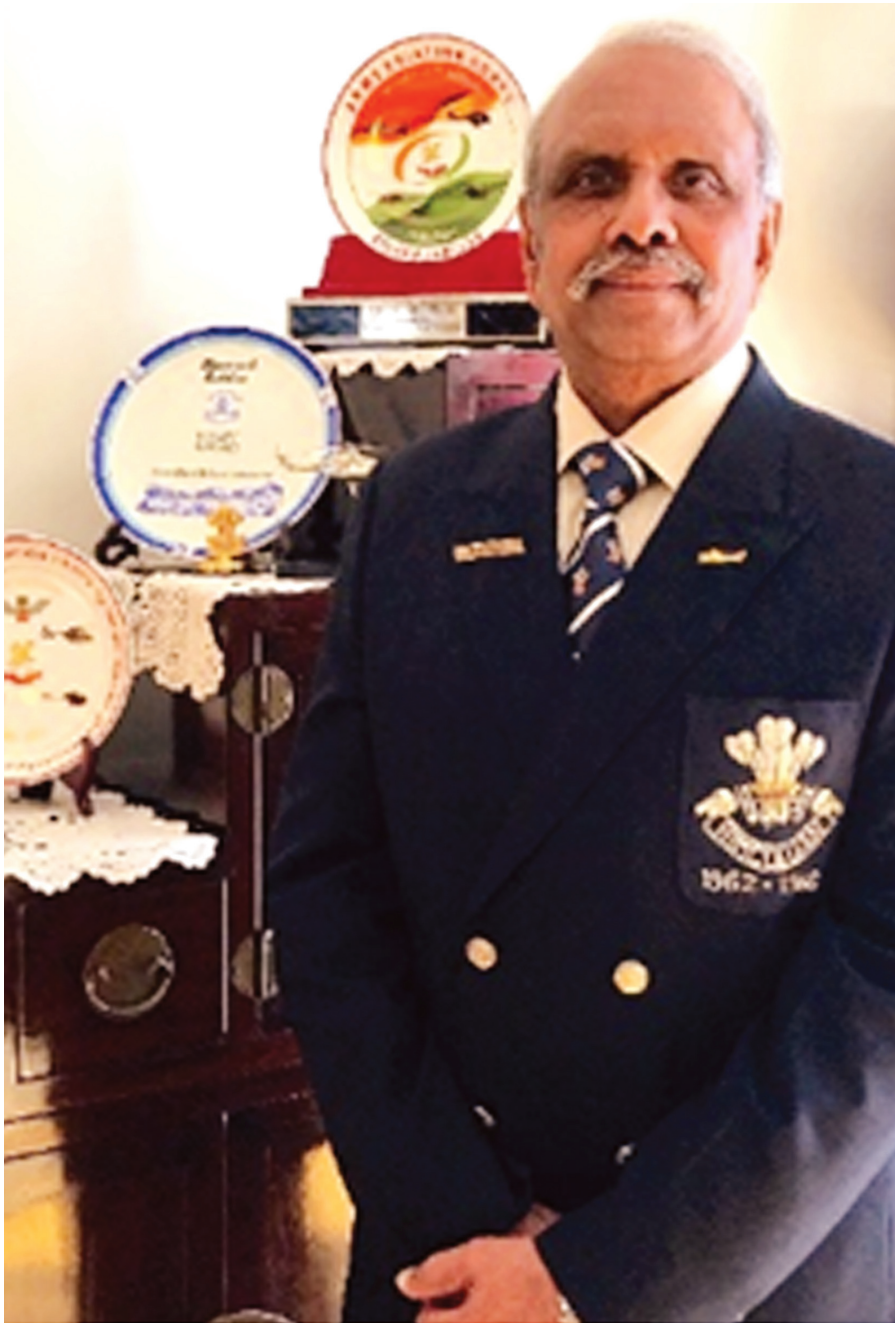
Proud to be a RIMCOLLIAN

have two stents in the Left Artery. I recalled the book "Reach for the SKY" while lying in the ICU, with oxygen tubes and blood flowing into my body. I told myself, if a person without legs can fly, why can't I, with a new and better functioning heart. I exercised, got back my energy and went back to the medical board. A rigorous and extensive check was carried out for a whole week, by an aviation medical