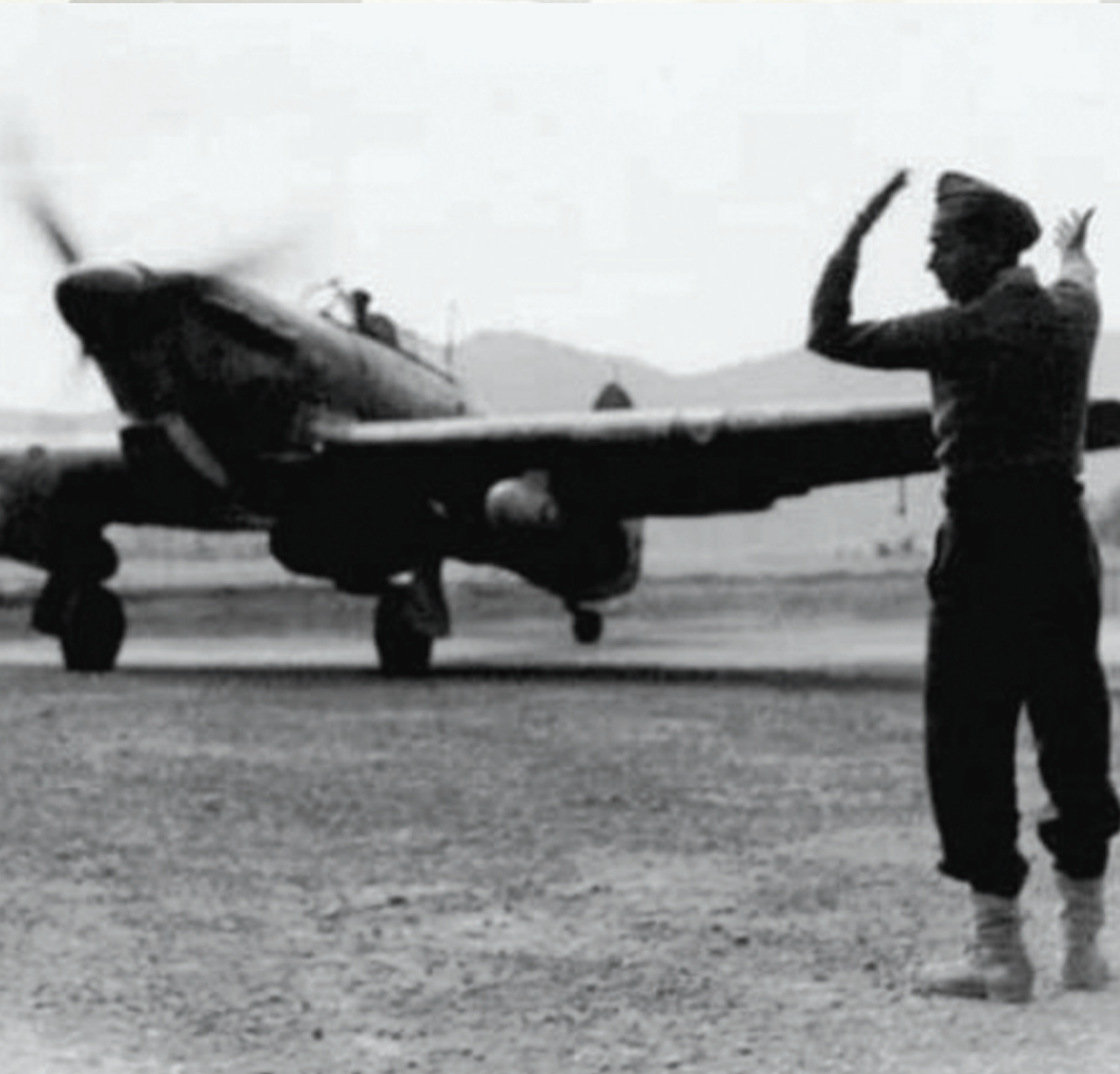
An IAF Hurricane is marshaled in after a photo-reconnaissance over the Japanese lines, Imphal, 1944