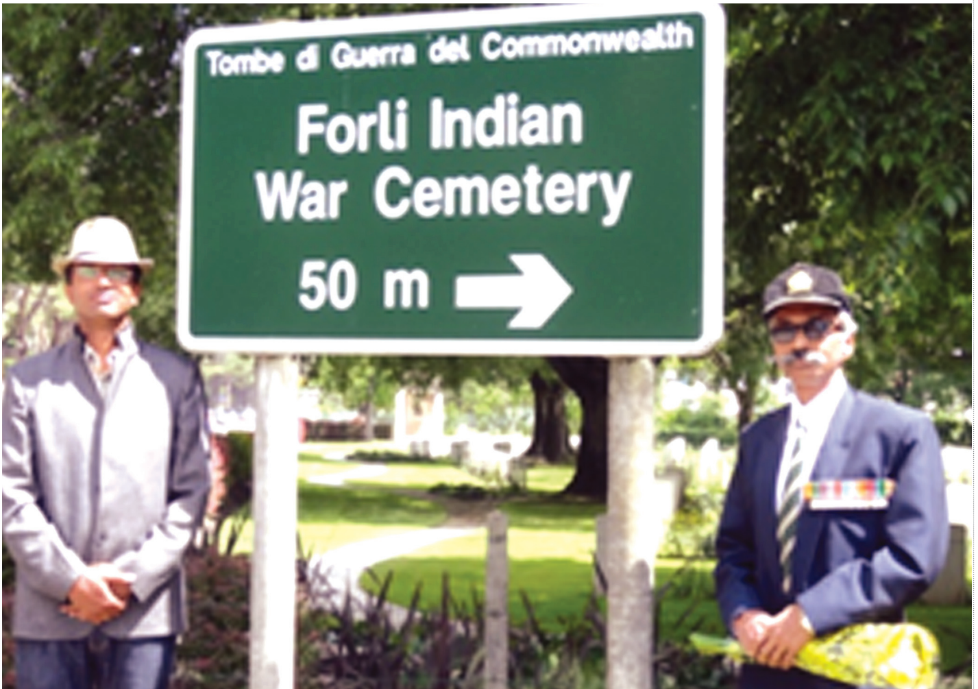
At Forli Cemetery

surprised to learn that we had arrived by train, were strangers to the place and had no knowledge of the location of places in Cassino we intended to visit. She politely asked us to ring up again after 15 minutes, which we did. We had planned to hire a taxi for the day but she requested us to wait, since a vehicle would pick us up to take us around. Sure enough, a black polished car, chauffeured by a smart policeman arrived soon after. Though he did not speak English, we managed to communicate through some commonly used words or sentences in Italian which I had noted earlier! We drove straight to the Cassino War Cemetery, the largest WW II Cemetery in Italy.