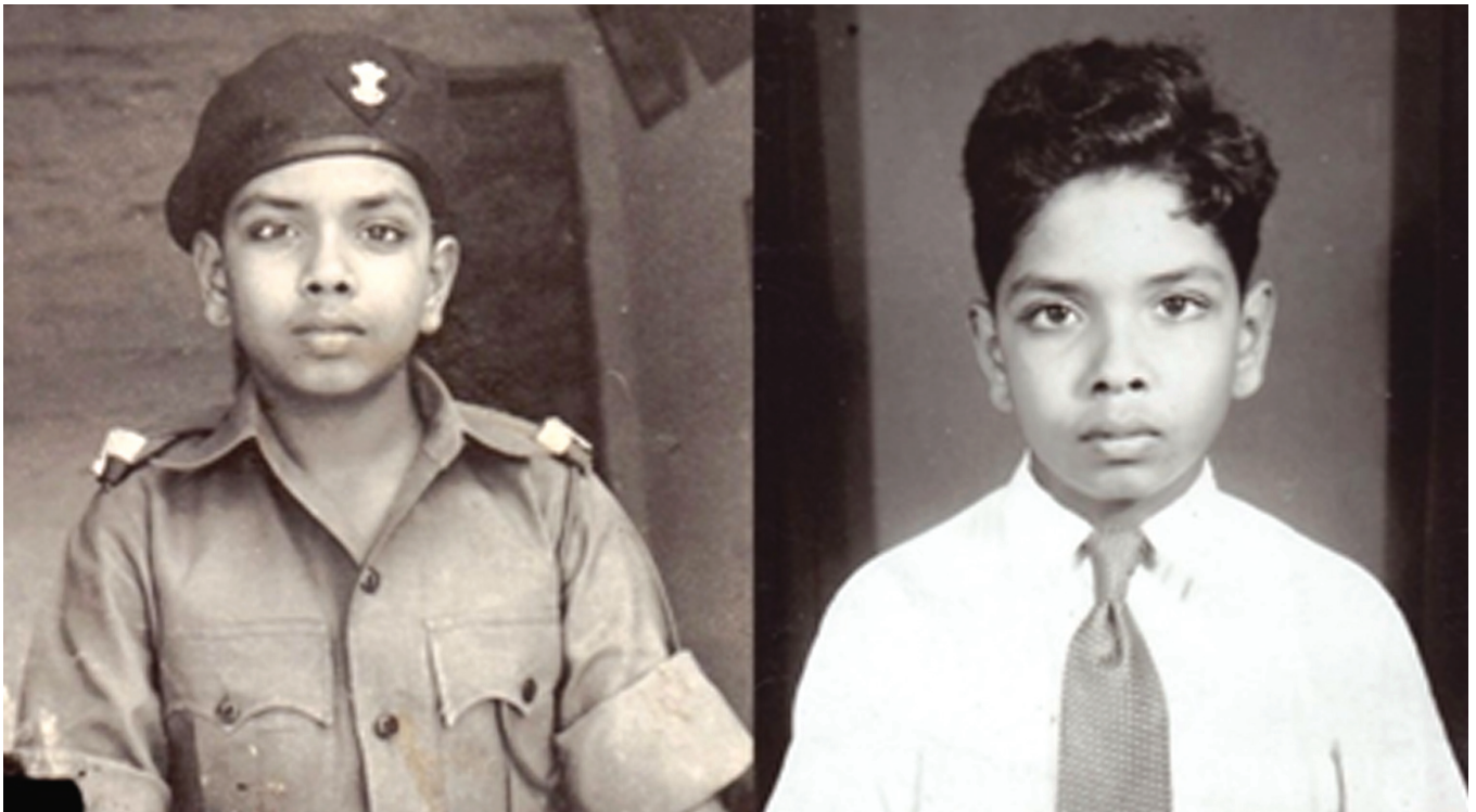
That was when the dream started !!! Dreamt of being a PILOT.