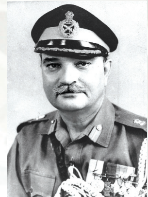
2/LT (LATER LT GEN) PREMINDRA SINGH BHAGAT