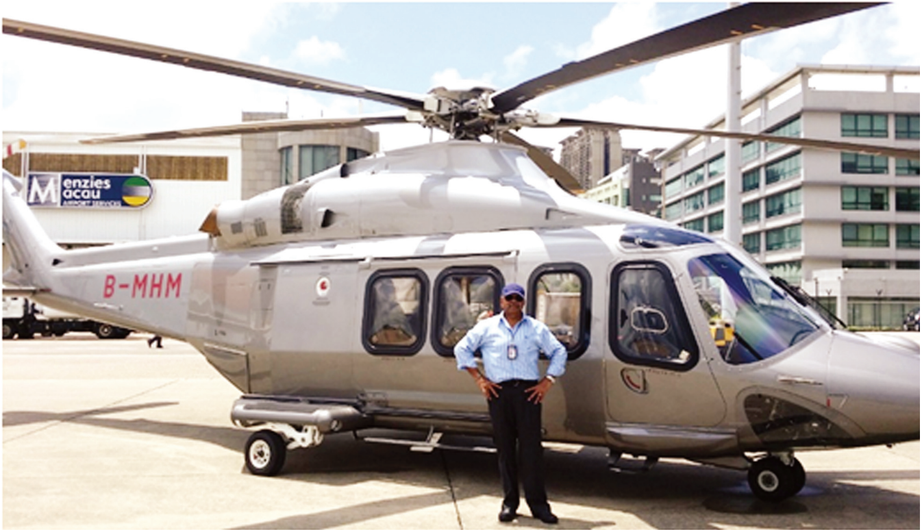
Back to Macau in 2014, to fly a Corporate VIP AW 139

had a spacing cable failure, on a Chetak on 07 Feb, 1977 (my second birthday). I survived, thanks to my Flight Commander, who was also a flight instructor. Incidentally, there are only 3 survivors in the history of spacing cable failures. I had only 200 hours of total flight time and 20 hours on type. The survivors: my Flight Commander, an ATC officer and me. There were more such failures which were all fatal. Later in 1980, I became a flying instructor and logged many hours as a pilot. I quit the Army after 15.5 years in 1986 as a Major, in pursuit of my passion. I went to the US in Oct 1987, to get my FAA Pilot's license.