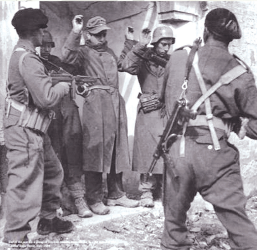
Troops from Central Indian Horse take German soldiers Prisoner of War in Italy in 1944