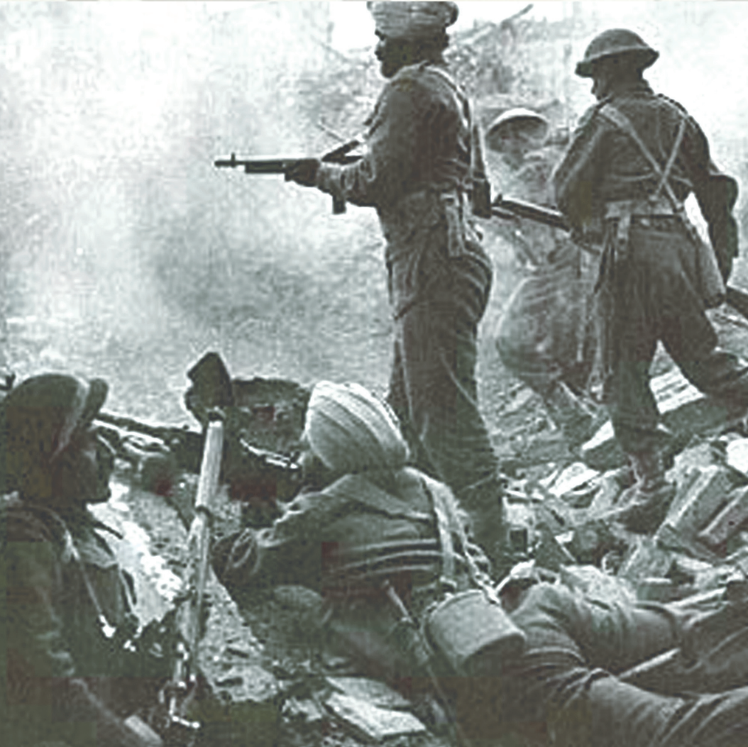
Soldiers of the British 8th Army fighting in the Italian campaign