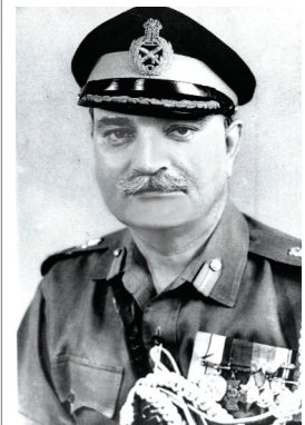
2/LT (LATER LT GEN) PREMINDRA SINGH BHAGAT