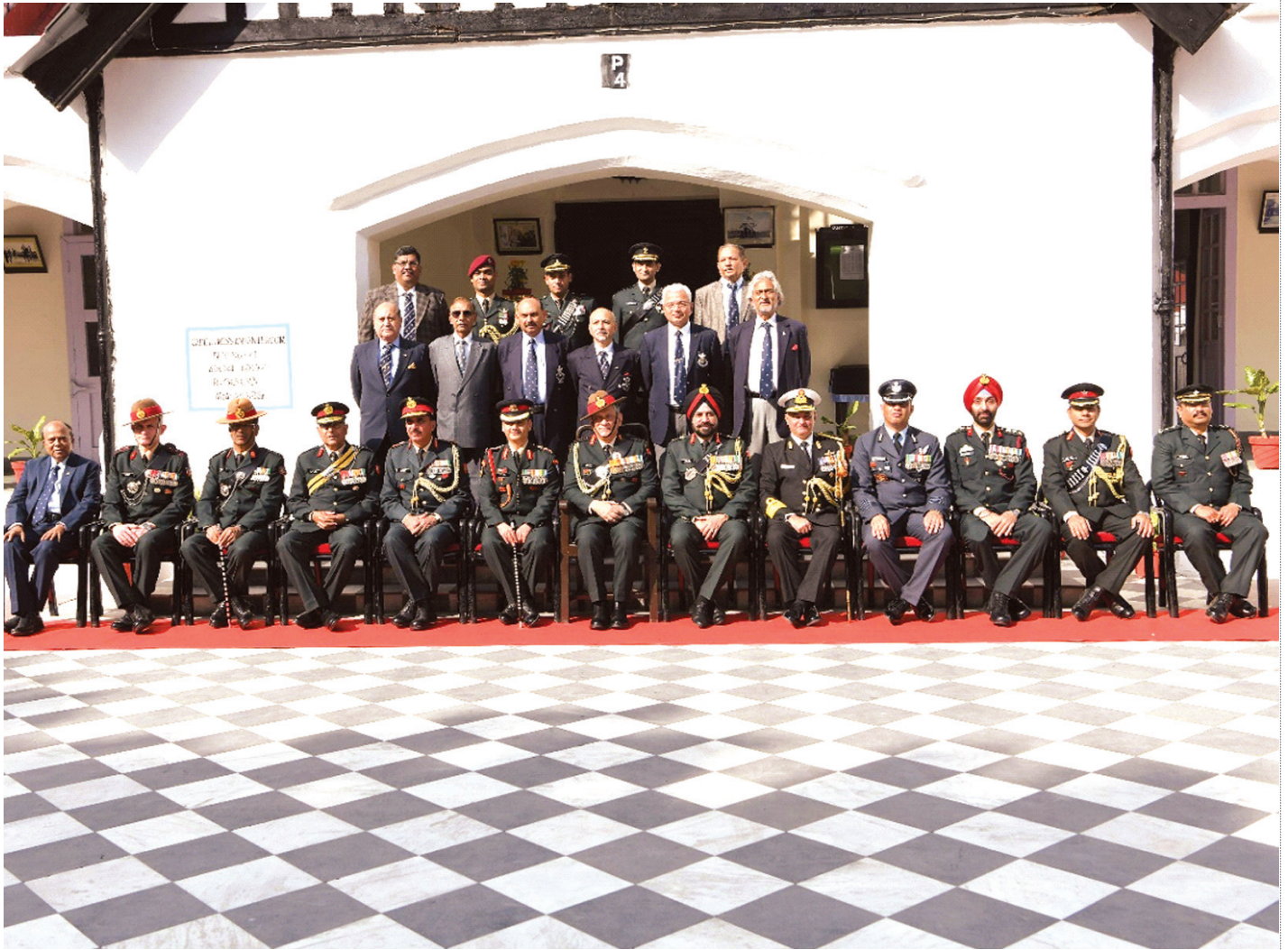
COAS with the Dehradun Rimcollians